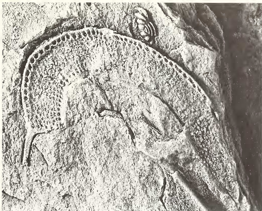
TEXT-FIG. 3. Protolloydolithus sp. nov. (SG 6717). Valongo formation, Placoparia ( Placoparia ) tournemini Biozone, Llandeilo. From small quarry approximately 1 km ESE of Covelo and 11 km SSE of Valongo. \times 6.5 .

reasonably distinct, pits smaller and more numerous than in E1 (where preserved, six or seven E1 pits lie adjacent to ten I1 pits). Preservation is generally rather poor for the rest of the fringe, and apart from the distinct innermost arcs appears to consist of randomly arranged pits. However, nine or ten A 'arcs' may be present across the fringe between the cheeks and E1. In or F (flange) pits (Hughes et al. 1975) cannot be clearly distinguished although on the right-hand side there are possibly a few F pits. Laterally at least two regular inner arcs are present. The pits of these arcs show regular concentric and radial arrangement for at least fourteen radial rows, while two more external arcs are seen (where preservation allows) to continue this regular arrangement for at least six radial rows. Suggestion of very faint facial suture cutting across base of genal spine, running subparallel to distal part of posterior border margin.